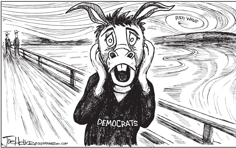
Joel Heller © 2024 HELLER.COM

If so, please write. Please remember that publication of submitted editorials is not guaranteed.